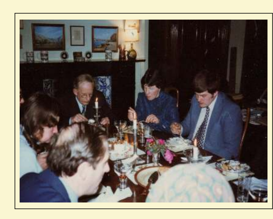
Villagers would jangle the bell and walk in, knowing the layout of the Rectory as well as their own houses.