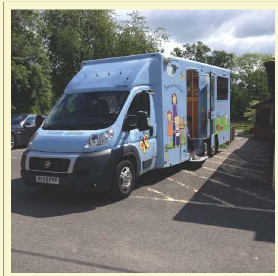
(Below): The mobile children's library, seen here parked next door to the Pre-School in 2015, visits every two weeks.