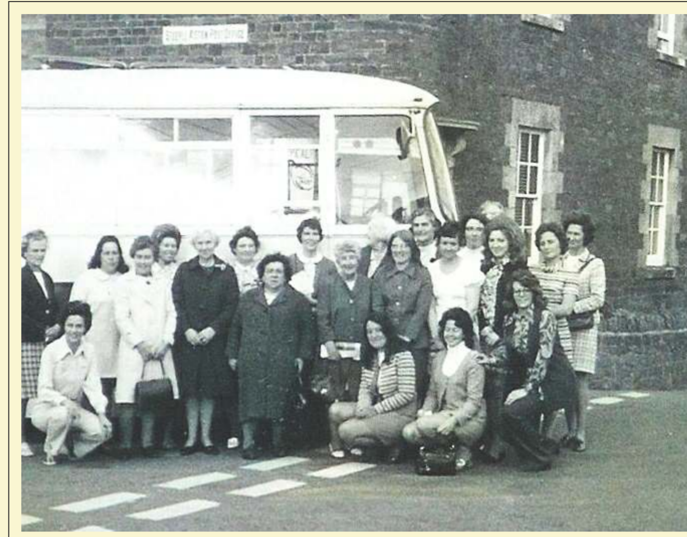
WI outing of 1973