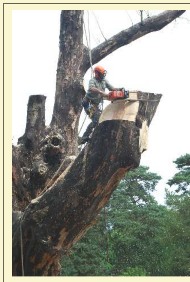
Steeple Aston's great sycamore was probably planted around 1806.