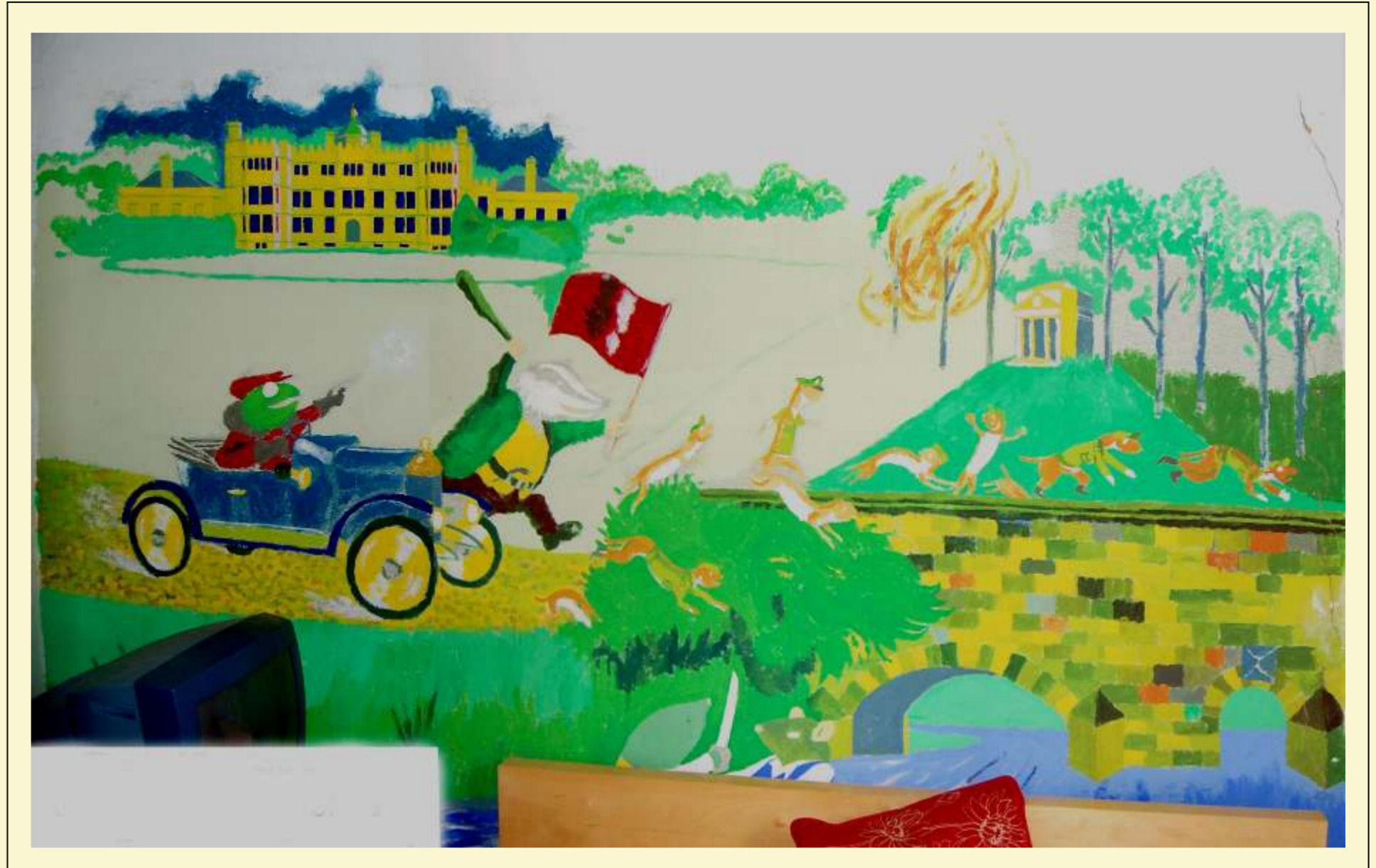
Found on the bedroom wall of a house in Steple Aston (above). Toad and Badger, representing British interests, drive the Weasels (dressed in US military uniform) out of Rousham House (Toad Hall) and over Heyford Bridge, an allegory of "Wind in the Willows". Below - a more direct message in the same house.

In vain as it turned out. The Centre was eventually built in Sheffield.